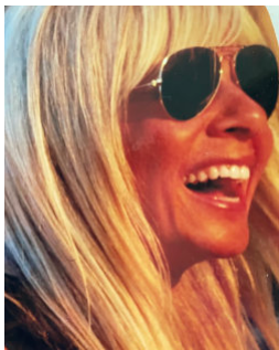
ED P. 12