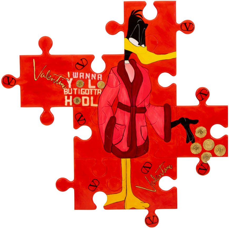
Cripto Couture 2023/2024 Wood and acrylic 120 x 90 x 1.5 cm