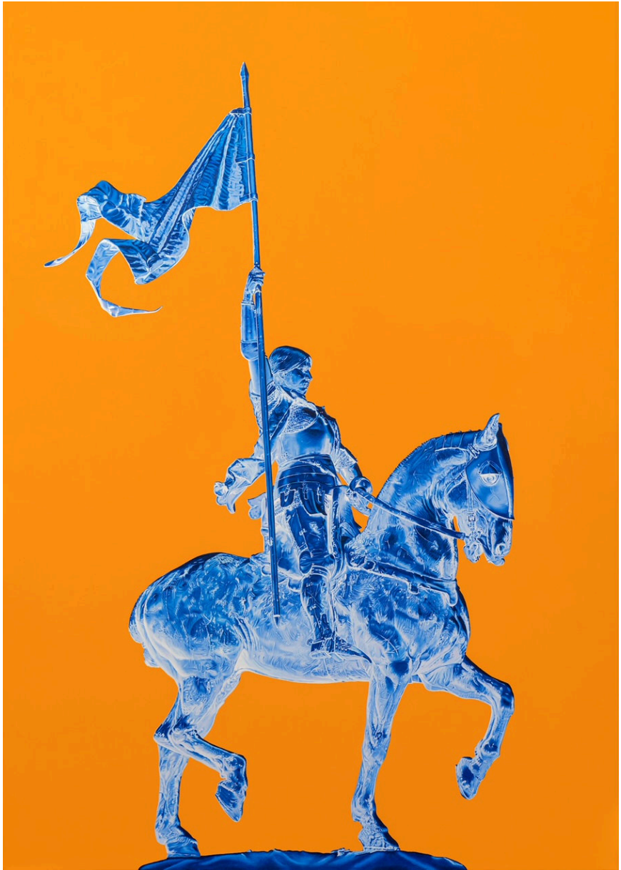
Jeanne d'Arc Oil on canvas 162 x 114 cm