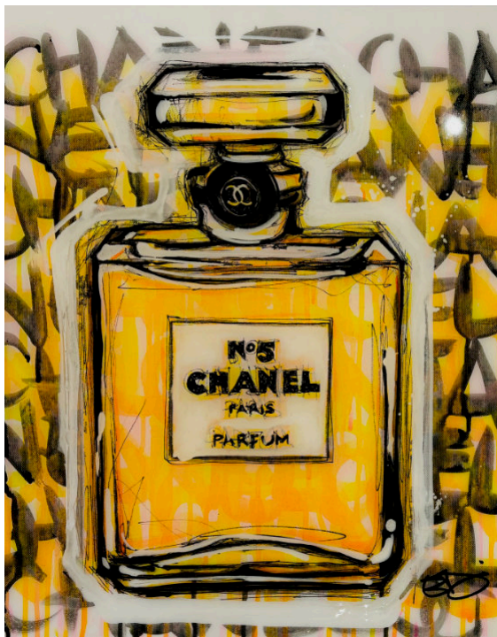
Le Flacon N°5 2024 Acrylic and epoxy resin 70 x 70 cm

ED exhibits in France and Europe, and in 2024-2025 she will be in Barcelona, Dubai, and Miami.