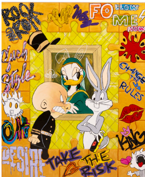
Nightmare at the Museum 2023/2024 Wood and acrylic 120 x 80 x 1.2 cm

Her unique and authentic vision speaks to her innate talent and artistic sensibility.