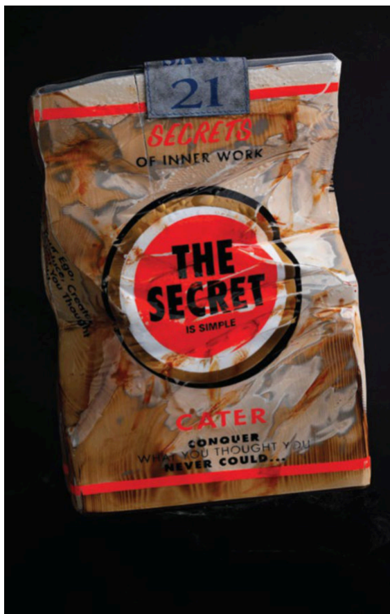
The Secret 2023 Wood sculpture 28 x 42 x 14.5 cm 6 kg

Exhibited in prestigious art shows around the world, his sui generis works challenge consumerist society, inviting introspection and the grasping of one's essence. Simultaneously, the artist's poetic and philosophical writings question the power systems and mass culture that restrict individual fulfillment.