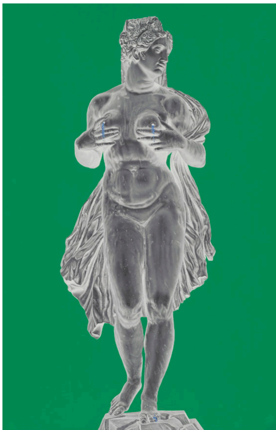
Pink Venus Oil on canvas 160 x 100 cm

She masters the subtlety of extracting all the nuances of black. She plays with light and symbolism to explore all its nuances. Everything is contradictory, she plays on the positive-negative duality, on white and black, on old and modern.