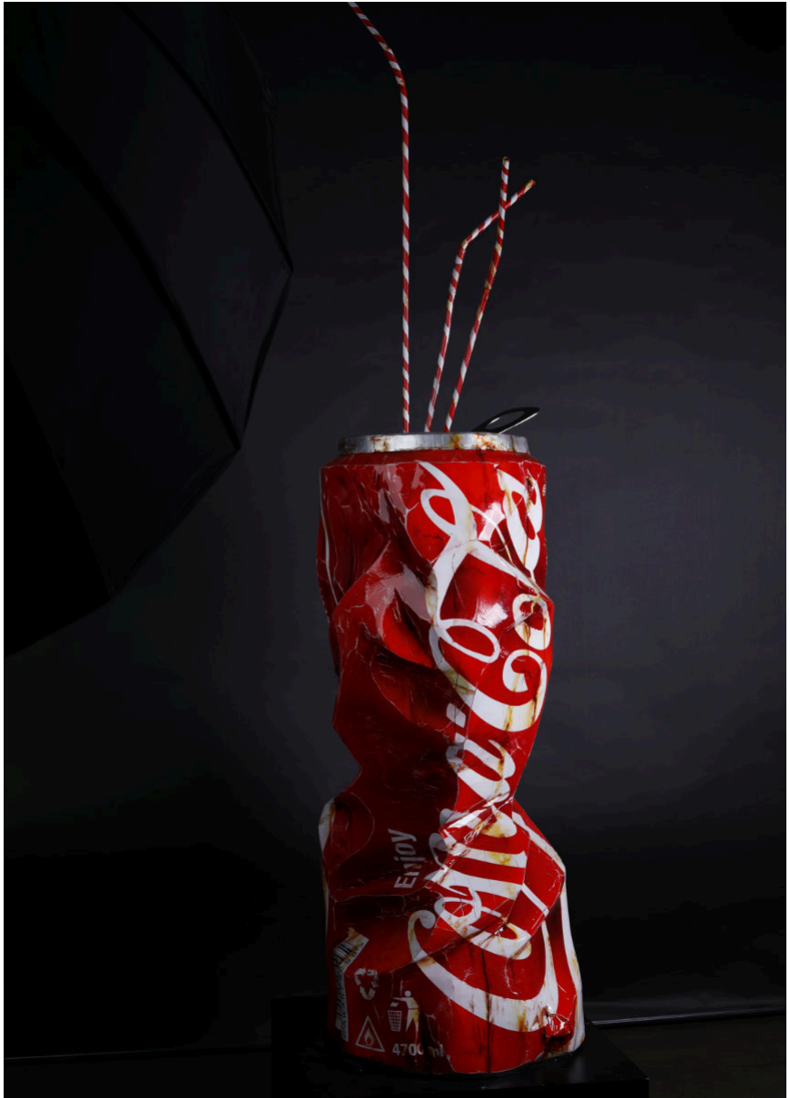
Coma Cola 2022 Wood sculpture 50 x 52 x 120 cm 90 kg